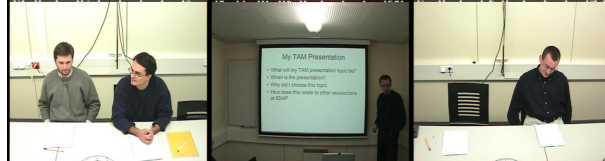
Figure 1: Multi-camera meeting room